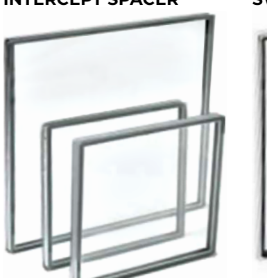
Colours: Stainless Steel